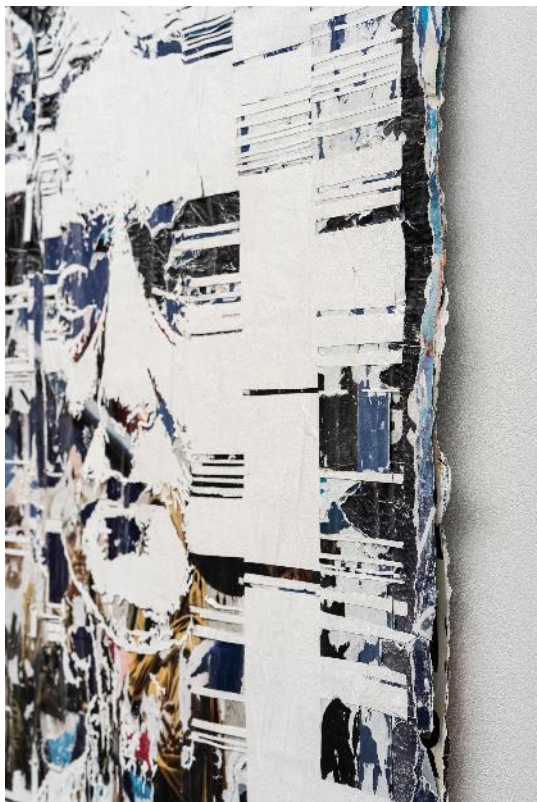
Alexandre Farto aka Vhils Glitch Series #06, 2024 Hand-carved advertising posters 110x80 cm € 18.500,00