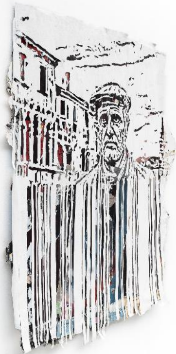
Alexandre Farto aka Vhils Glitch Series #04, 2024 Hand-carved advertising posters 110x80 cm € 18.500,00